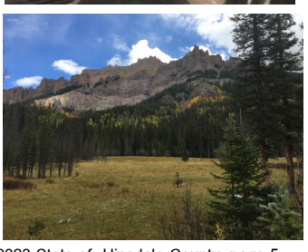
2023 State of Hinsdale County, page 5