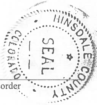
Exhibit A HINSDALE COUNTY ASSIGNMENTS/APPOINTMENTS FOR CALENDAR YEAR 2019